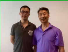
Fulbright Research Scholar Award 2016/17 for Exchange at University of Michigan