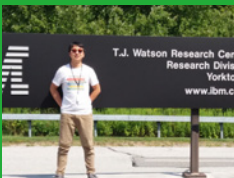
IBM Thomas J. Watson Research Center