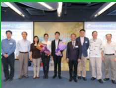
SENG PhD Research Excellence Award 2016/17