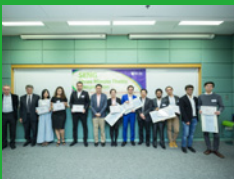
SENG Three Minute Thesis Competition 2017